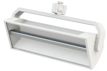
Weight: 1.8 lb