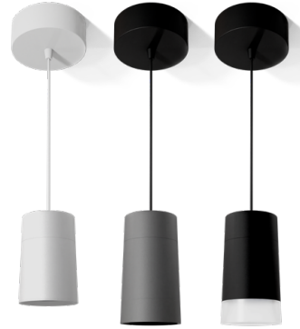
Perfect White, Silver + SN, Black + AS