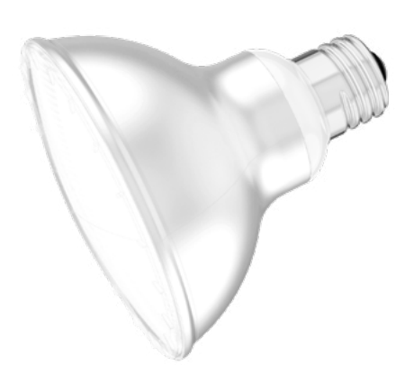
Weight: 7.4 oz.

OPTICS<sup>2</sup> involves a recessed primary optic and surface secondary optic that allows Solais LRP lamps to duplicate the exact performance and aesthetics of incandescents.