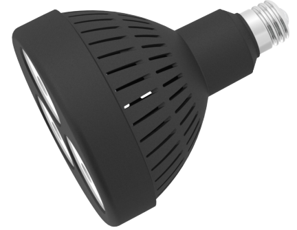
Weight: 9.6 oz.