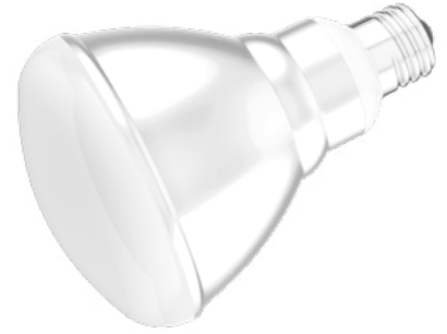
Weight: 6.6 oz.